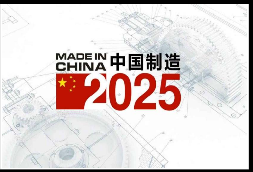
Figure: Manufacturing value-added by largest global manufacturers.