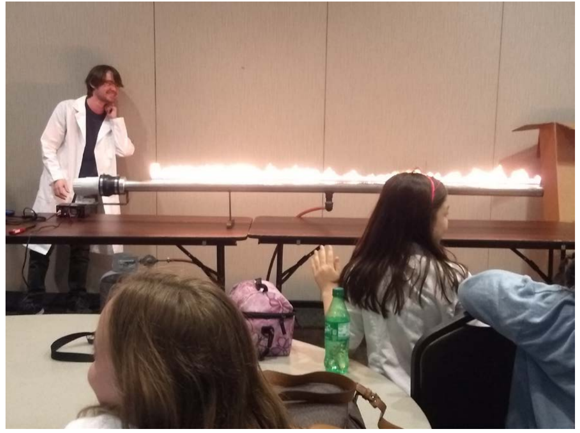
Demonstration of the Ruben's Tube. Everybody requested their favorite song!