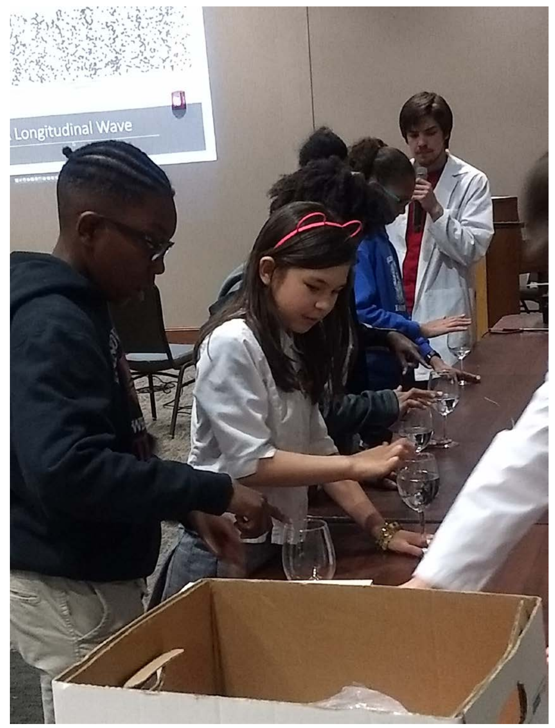
Kids playing with wine glasses to demonstrate resonant frequency.