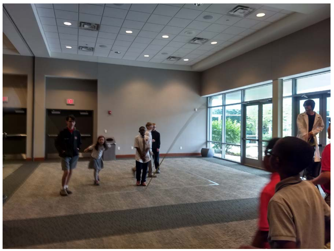
The "Ultimate Jump Rope" demonstrating harmonic frequency and an engaging, fun activity as students attempted to jump in the antinode portions.